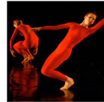
Paris Flocks to a Cunningham Revival