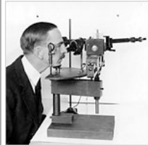
Zoom: Errol Morris Responds to Readers