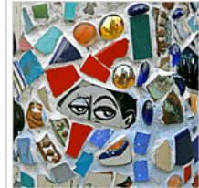
A Mosaic Path Charts a Neighborhood's History

Home | World | U.S. | N.Y. / Region | Business | Technology | Science | Health | Sports | Opinion | Arts | Style | Travel | Jobs | Real Estate | Automobiles | Back to Top Copyright 2006 The New York Times Company | Privacy Policy | Search | Corrections | RSS | First Look | Help | Contact Us | Work for Us | Site Map