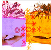
A Gift That Gives Right Back? The Giving Itself