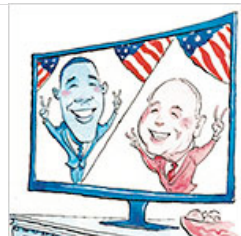
After the Ballot, the Bash