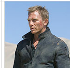
Special Section: Holiday Movies