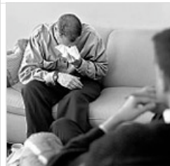
Op-Classic, 2000: Election Worries