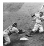
Jackie Robinson - 1952 Buy Now