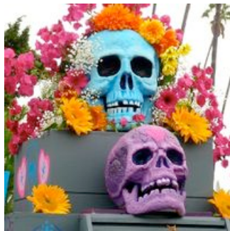
Day of the Dead Altar

New York City celebrates the Day of the Dead, or Día de los Muertos , October 30 through November 2.